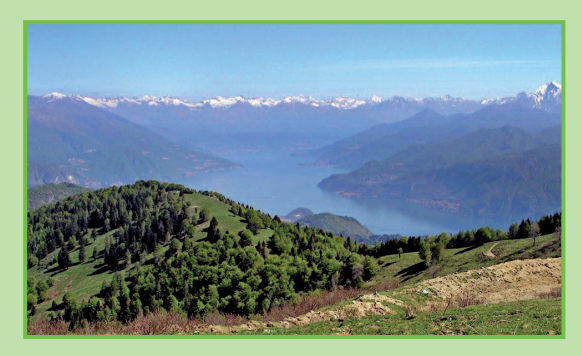
View from Monte San Primo

Past a gate, continue uphill along the path that ascends through a beech wood until it comes out in the pastures of Alpe delle