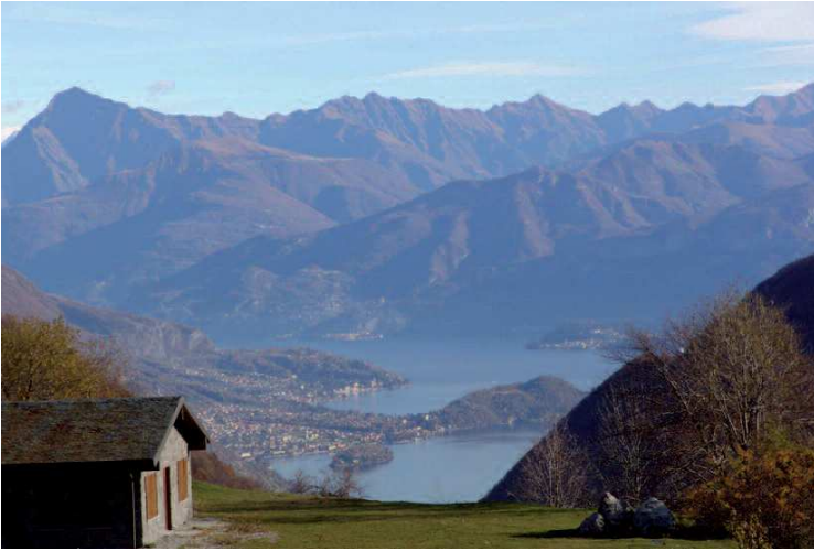
Pian delle Alpi

On the first part of this section one has to deal with an ascent of 1.000 m up the slopes of Monte Bisbino. The second part has less ascent, offers beautiful views and runs along Sasso Gordona with its tunnels and emplacements built during the First World War.